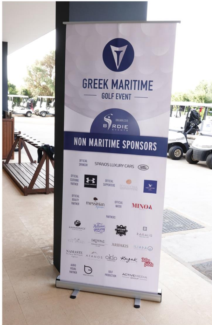
Logo Placement on Roll-Up Banners